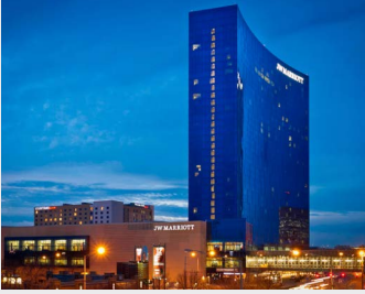
JW Marriot Indianapolis 10 S West St. Indianapolis, IN 46204

Alabama JAG Specialists will coordinate all hotel reservations for their program delegates. The host hotel allows up to four (4) students in a hotel room. If you do not have four students of the same gender to room together you may, according to your own school's standards, choose at your own discretion to coordinate room blocks with nearby schools/programs. This remains at the discretion of the specialist and their school's policies and procedures. All conference participants are required to book rooms through the conference hotel and must stay at the conference hotel in accordance with the National JAG guidelines.